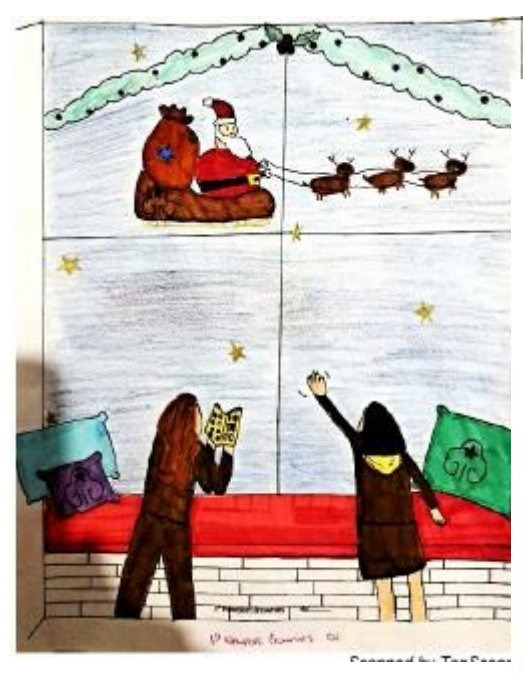
↑ The Overall winner of the Christmas Card competition I comes from 1st Newport Brownies

Second in the Brownie Section comes from 3rd Brentwood Brownies>