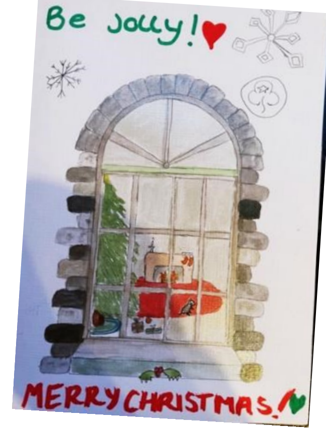
^ First in the Rangers Section comes from Fyfield Rangers

Hope you all have a restful Christmas and look forward to receiving lots of articles for the newsletter in 2025.