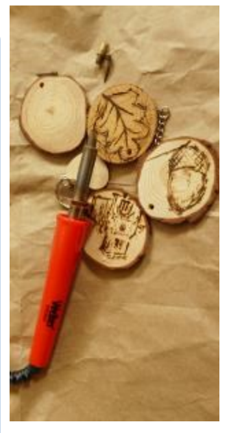
A pyrography tool in action—it decorates by burning wood or MDF blanks

If you wish volunteer or find out more about the craft library email comms.ggew@gmail.com