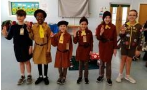
1st Romford Brownies dressing up in Brownie Uniforms through the ages as part of their 10th Birthday Celebrations

Do you have a girl who will struggle to buy uniform? Has your hall rent gone up due to the financial crisis? Do you need help to meet the costs of annual subscriptions? Anglia Region cost of living grants can help with all these problems and the process is really simple. Take a look at the region website where you will find all the details- all you have to do is fill out a short form, submit your last set of accounts and send it in. My own unit did so and received £250.00!! If you need any help then drop me a line.